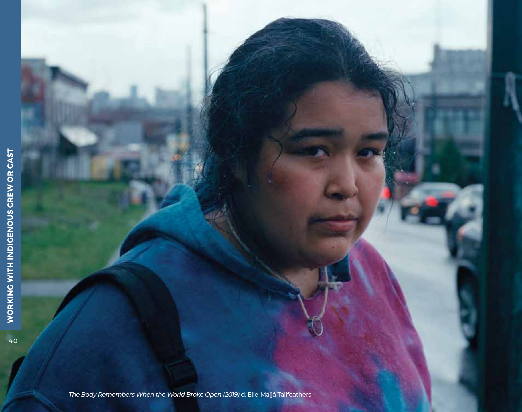
The Body Remembers When the World Broke Open (2019) d. Elle-Máijá Tailfeathers